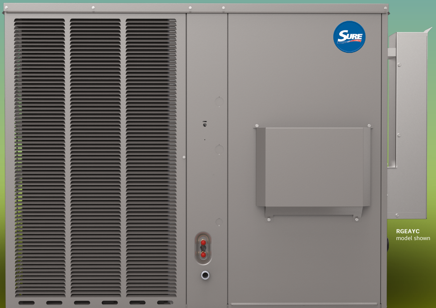
RGEAYC model shown