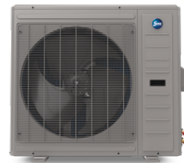
4 ton RD16AY48AJVCA