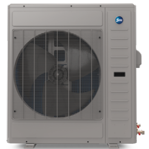
5 ton RD16AY60AJVCA