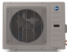
2 ton RD16AY24AJVCA