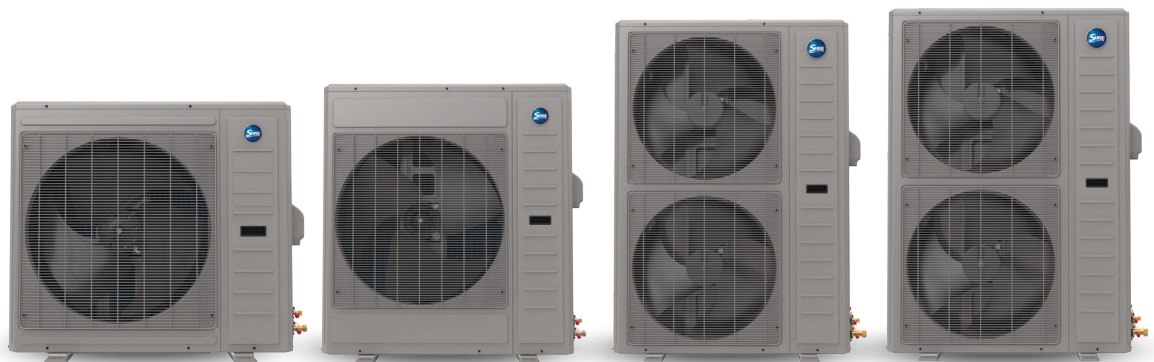
2 ton RD18AY24AJVCA